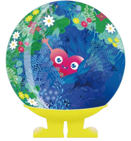
Official Mascot Tunku Tunku

GREEN×EXPO is the abbreviated name of the International Horticultural Expo that will be held in Yokohama, Kanagawa Prefecture (at the former site of the US military's Kamiseya Communications Facility) in 2027. The name is a combination of “green” — referring to plants, flowers, and greenery, as well as nature and being environmentally friendly — and “expo”, an international exposition whose purpose is to contribute to solving globally shared issues. The name reflects the desire for the expo to act as a space for exploring ways to achieve sustainable relationships between nature, humans, and society, and for sharing this knowledge with the world. This will be the first time in 37 years that Japan will host an A1-class International Horticultural Expo (the last time being Expo 1990 Osaka) and it has also been officially recognised as an expo by the BIE (Bureau International des Expositions).